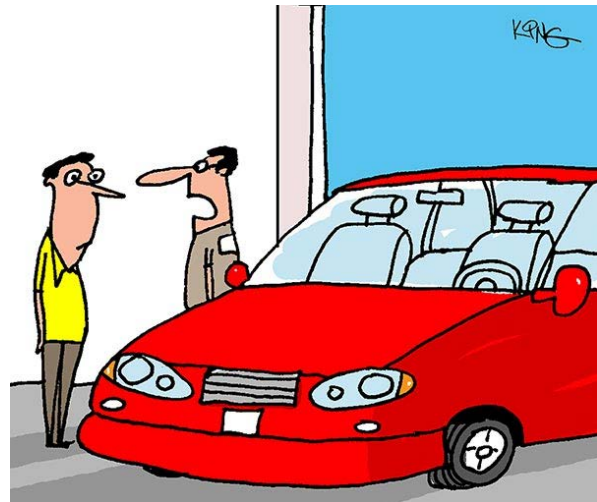
As part of the tech package, it'll temporarily turn into a Corvette when your friends come around!

In honor of St. Patrick's Day, I painted your car green.