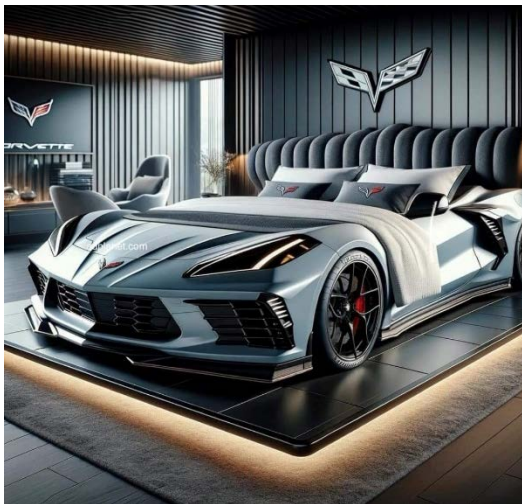
The ultimate bed for Corvette owners!